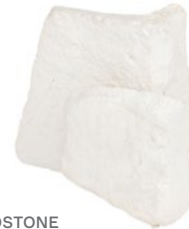
NATURAL FIELDSTONE WHITEHAVEN

For more information pghbricks.com.au/pgh-stone 13 15 79