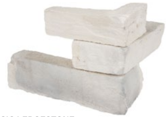
CLASSIC LEDGESTONE WHITEHAVEN

Corner stones are available to suit all products and colours.