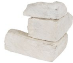
RUGGED LEDGESTONE WHITEHAVEN