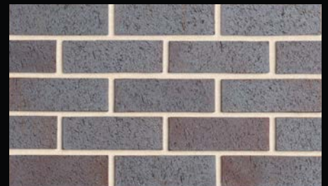
Blue Steel Flash