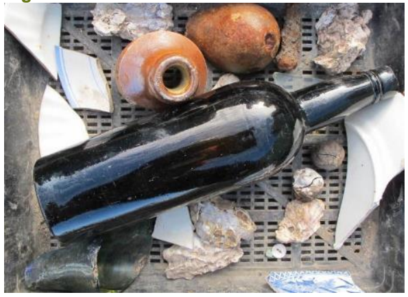
Figure 7: Historical footings