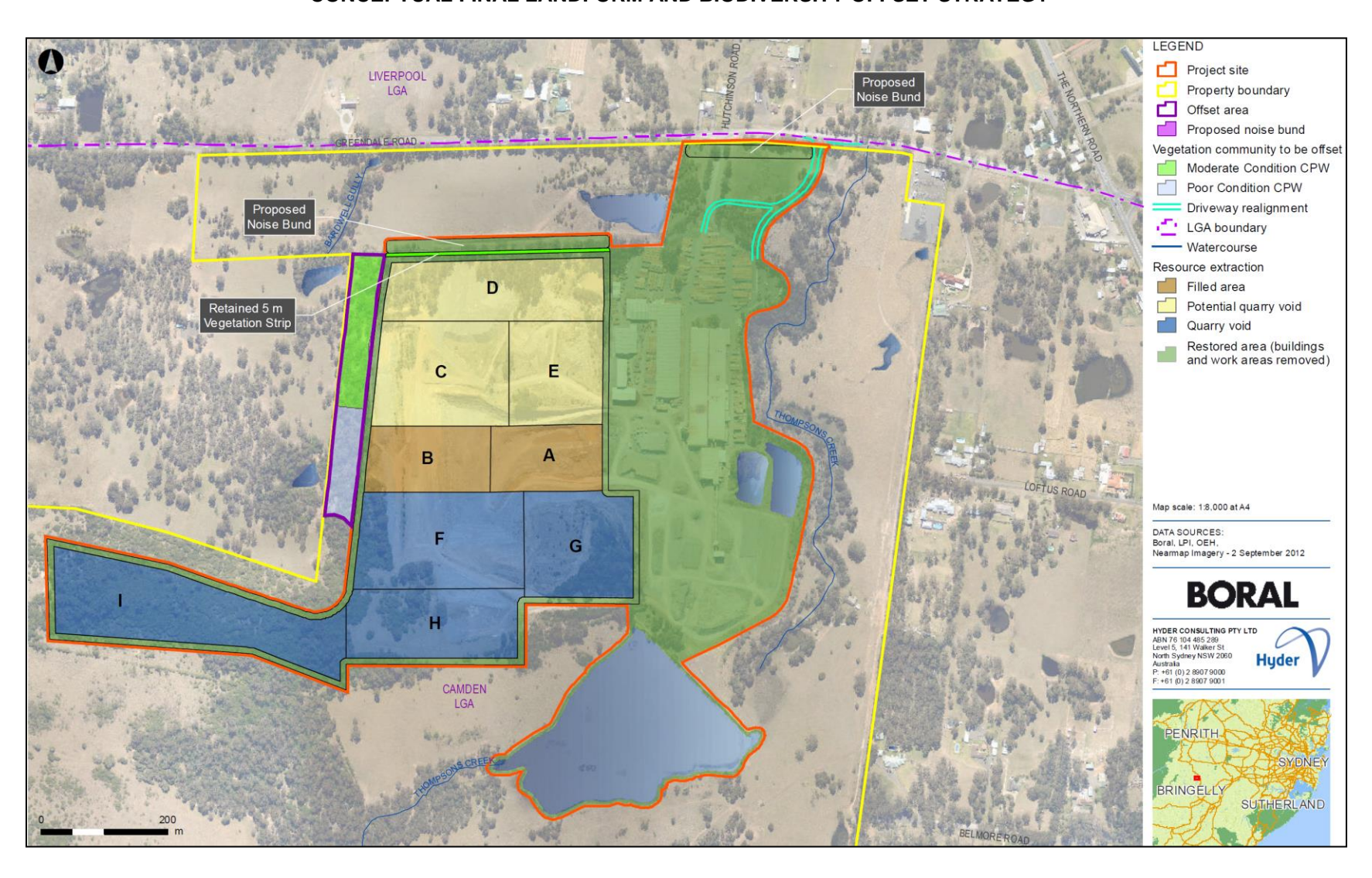
APPENDIX 4 CONCEPTUAL FINAL LANDFORM AND BIODIVERSITY OFFSET STRATEGY