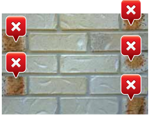
The face is clean so headers must be also

Some simple guidelines shown here will assist us in reaching that goal.