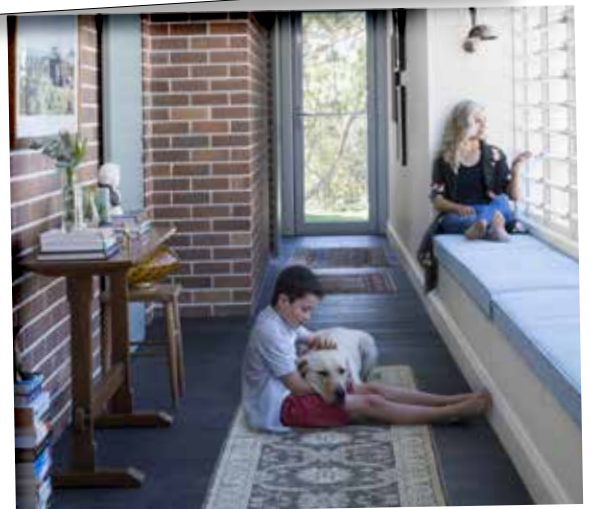
Bricks have been featured throughout the hallways to create a contemporary industrial feel.