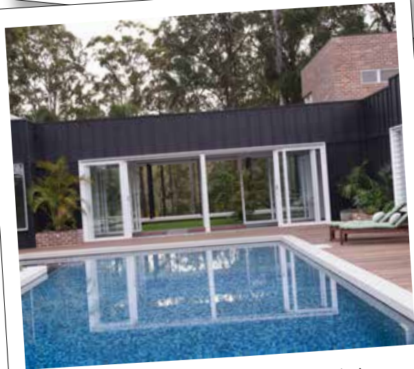
The Duffys created an industrial look that's hot in Australia right now, a contemporary composite façade of brick and timber cladding.