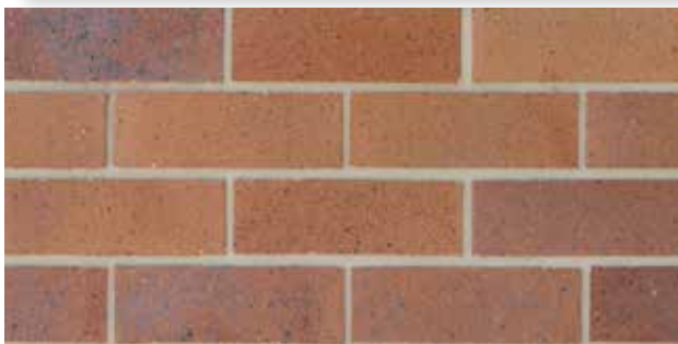
HAWKESBURY BRONZE DRY PRESSED